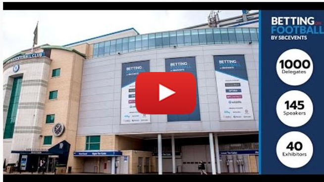
Betting on Football 2017