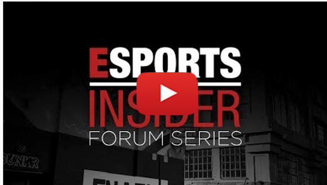
ESI Forum - August 2017