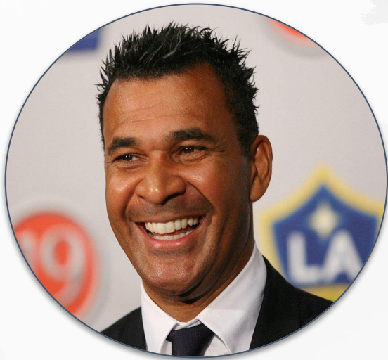
Ruud Gullit Founder of Team Gullit

Esports Insider Super Forum Keynote Speaker