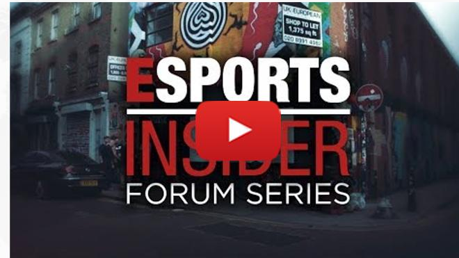
ESI Forum - September 2017