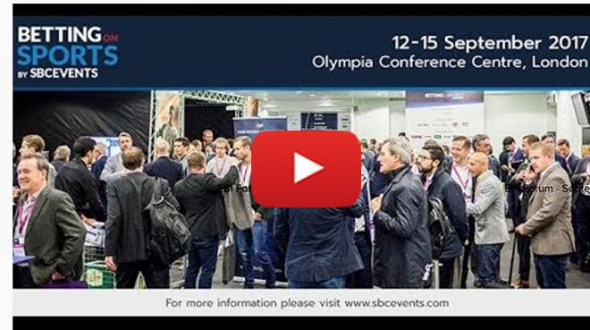
Betting on Sports 2017